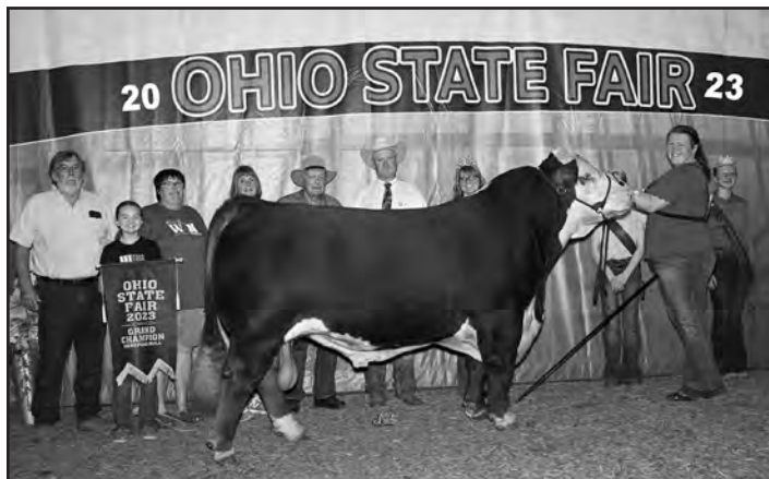
Grand Champion Bull: TJ 2296 DOUBLE DOWN1

by UPS Sensation 2296 ET – Peak & Williams Herefords, Mount Gilead, Ohio