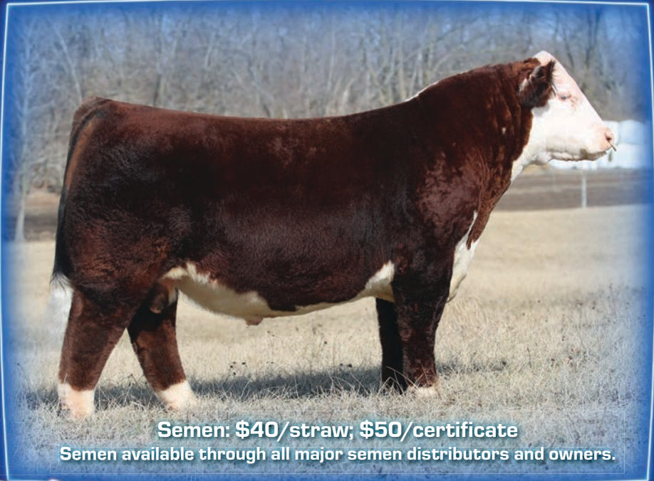
Semen: $40/straw; $50/certificate Semen available through all major semen distributors and owners.