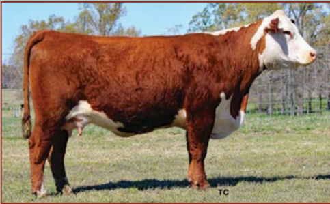
THM 078 Wynter 4183 — Dam Sire: Mohican THM Excede Z426 / NJW 73S W18 Homegrown 8Y ET