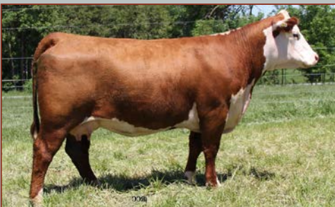
Stonewood Yoplait 2Y — Dam Sires: NJW 73S M326 Trust 100W ET / THM Avatore 2108 ET