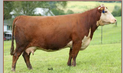
ASM 308 100W Miss Adair 429BET— Dam Sire: NJW 73S W18 Homegrown 8Y ET

Dam: THM 078 WYNTER 4183 • P43539459 Sired by: NJW 73S W18 HOMEGROWN 8Y ET • P43214852