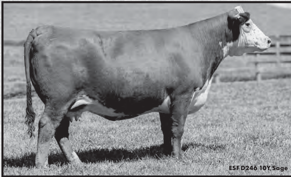
ESF D246 10Y Sage

12 NOON • LABOR DAY MONDAY, SEPT. 2, 2024