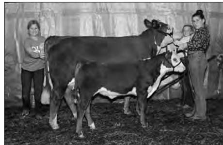
Reserve Grand Champion Cow/Calf Kinalee Connolly with MV Chloes Little Lady 28