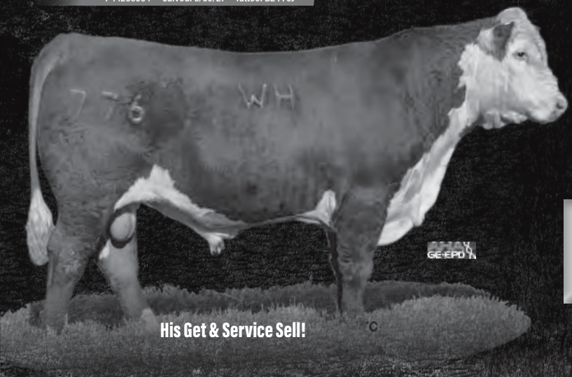
His Get & Service Sell!

P44286554 - Calved: 3/30/21 - Tattoo: BE 776J