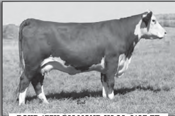
BOYD 135U DIAMOND VACA 0103 ET