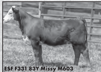
ESF F331 83Y Missy M603