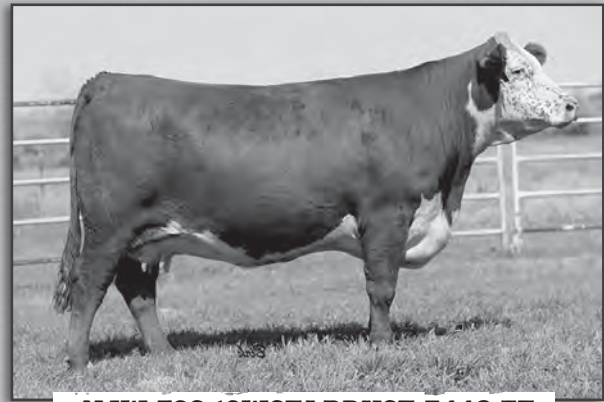
NJW 76S 10W STARDUST 344G ET