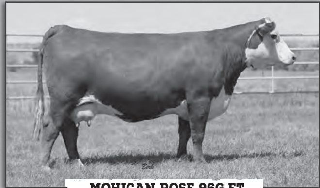
MOHICAN ROSE 96G ET

Herd Bulls Entire Cow herd Bred and Open Heifers ET Calves Semen