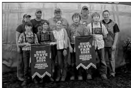
Premier Breeder & Exhibitor Ostgaard Cattle Company