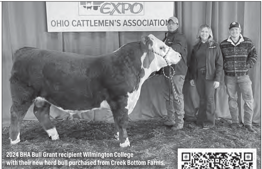
2024 BHA Bull Grant recipient Wilmington College with their new herd bull purchased from Creek Bottom Farms

Application form can be found on the BHA Facebook and webpage. Applications must be received by January 1, 2025.