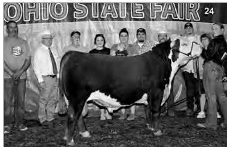
Reserve Grand Champion Bull Wilson Stock Farm with MML Joe Havoc 7L